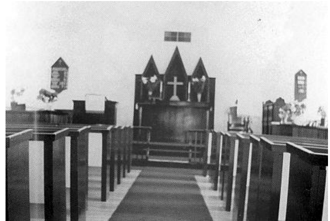
Original pews and pump organ