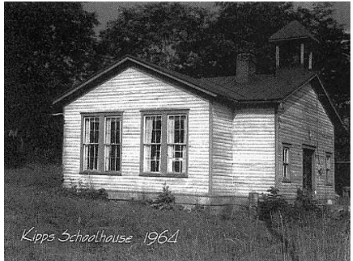
Kipps Educational Building