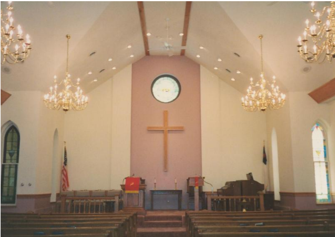
Sanctuary Remodeling Complete and Dedicated on December 24, 1988

Church website: http://www.mtjacksonumc.com Telephone: (540) 477-2128