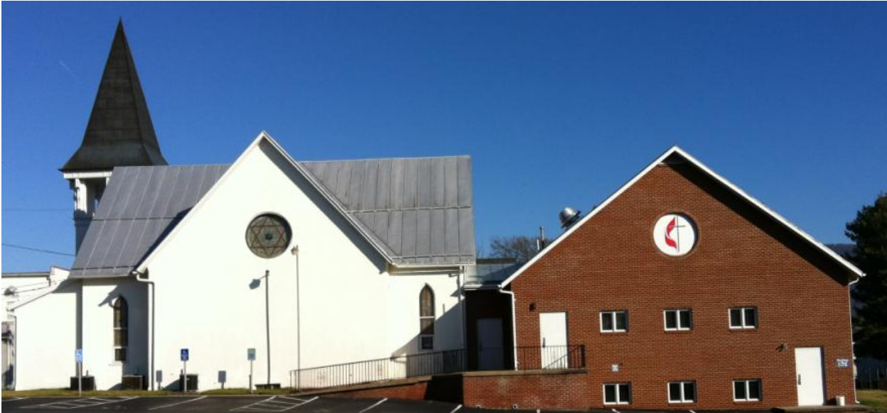
Church with completed Education and Social Building October 1985